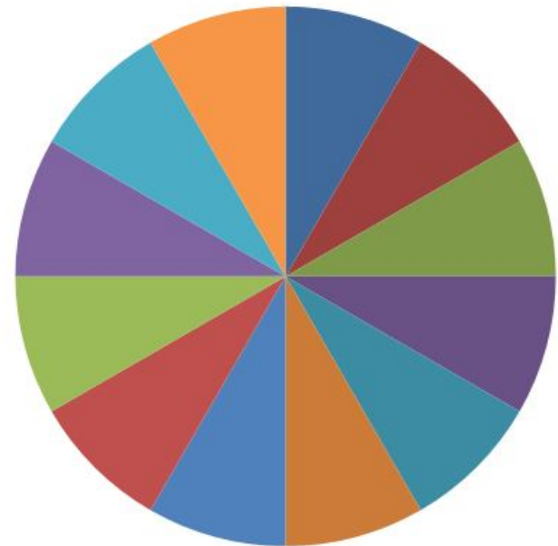
Privcore's Privacy Pie

Security is only one component of privacy