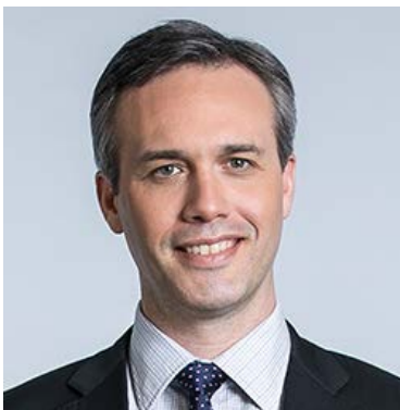
Edward Santow Australian Human Rights Commissioner humanrights.gov.au edward.santow@ humanrights.gov.au